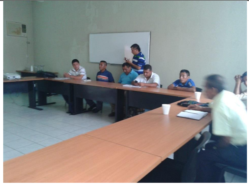
Meeting with project team to discuss the protected area zoning.